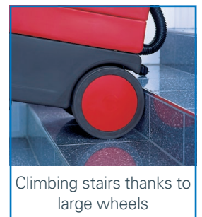
Climbing stairs thanks to large wheels