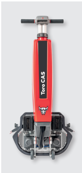
Cleanfix Toro CAS in transport position