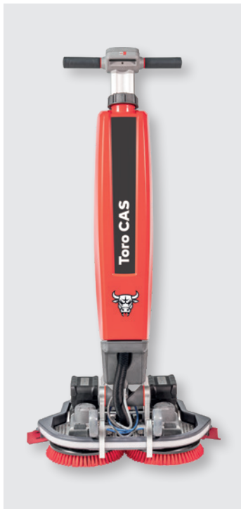
Cleanfix Toro CAS in working position