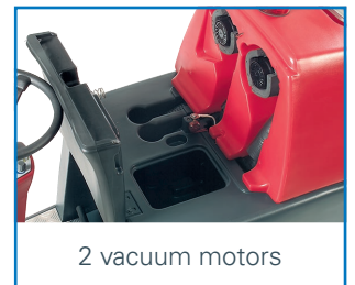
2 vacuum motors