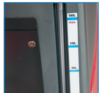
Scale for fresh water tank