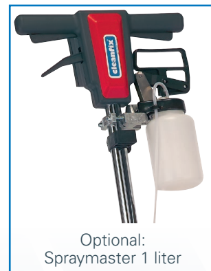
Optional: Spraymaster 1 liter