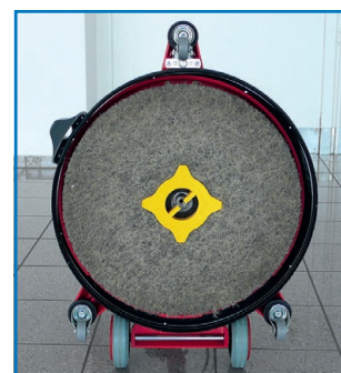
Machine with integrated driving disc