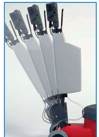
Fully adjustable telescopic handle, optional with solution tank