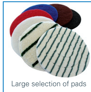
Large selection of pads