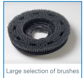
Large selection of brushes