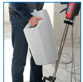
Easy mounting and demounting of the solution tank (optional)