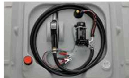
Pick-up 210L with pump 12V