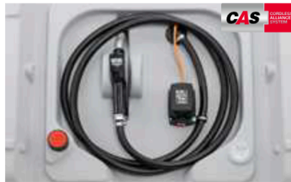
Pick-up 210L with submersible pump CENTRI SP30 18V and CAS battery