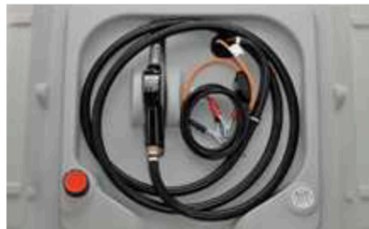
Pick-up 210L with submersible pump CENTRI SP30 12V